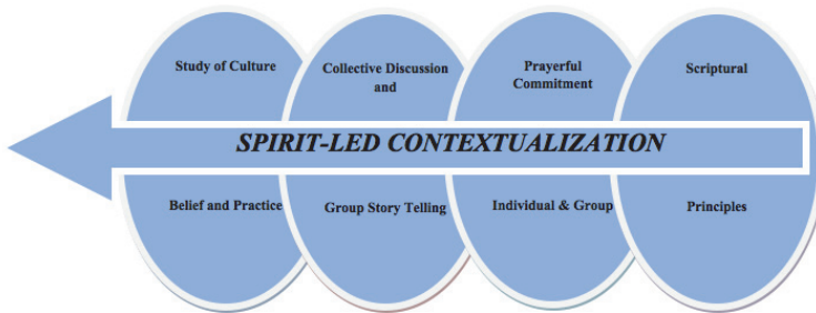
Figure 2. Role of the Spirit in Contextualization Among Malawi Assemblies of God Pastors.